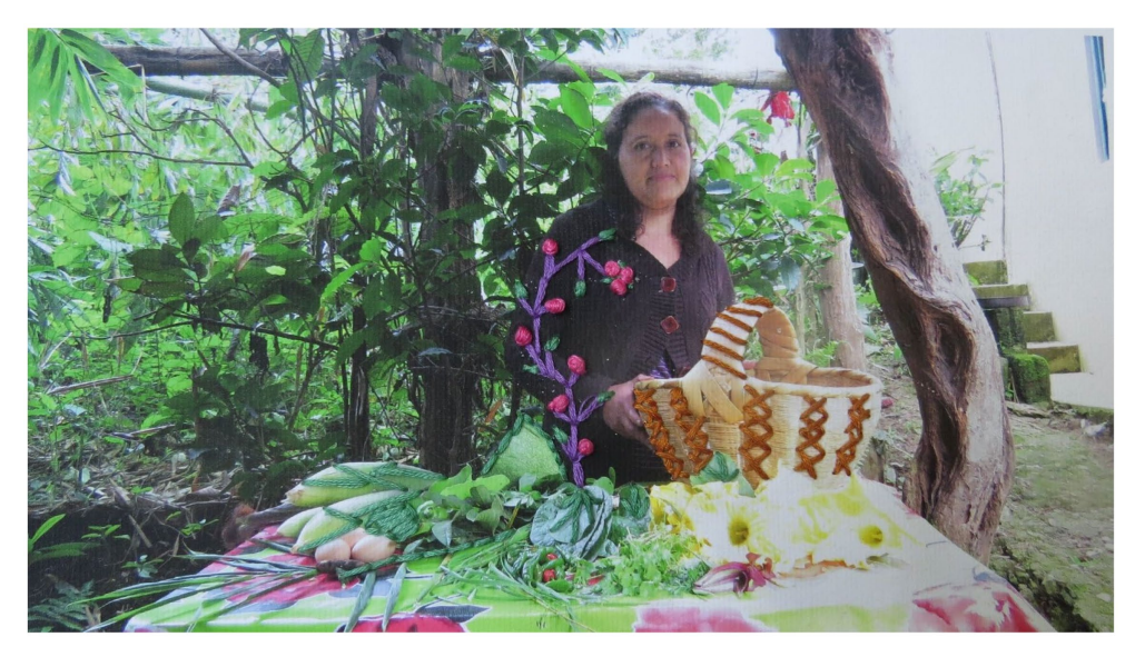
FIGURE 6 The colored threads representing the knowledge of women coffee growers on integral health, food gathering and bartering as contributions to food sovereignty. Photo-embroidery by Thelma Pontes.

women live and work every day (Lara Junior, 2010). A sense of belonging and collective identity is also reinforced through the mystique (Lara Junior, 2010). For coffee grower women, the mystique also has the following meanings: