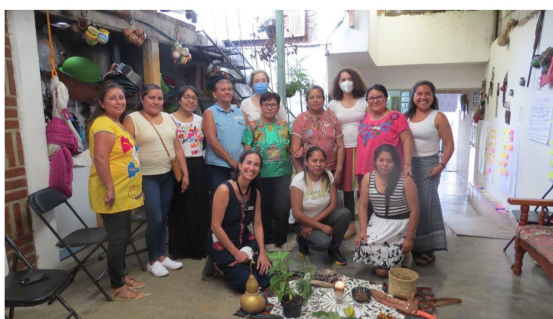
FIGURE 4 Meetings with women coffee growers' peasant feminists organized in VIDA, in Ixhuatlán del Café and Cosautlán de Carvajal, Veracruz, Mexico, in 2021.

of coffee women at the center of epistemological production. The research was conducted between 2020 and 2023. Due to the COVID-19 pandemic, virtual meetings were initiated to establish the research team and the co-design of the different stages of the process. In 2020, the concept and practice of food sovereignty was discussed in more depth by VIDA and the first article was collaboratively generated (Pontes et al., 2021). The first face-to-face meetings were held in 2021 (Figure 4), in compliance with security protocols and with a small number of people.