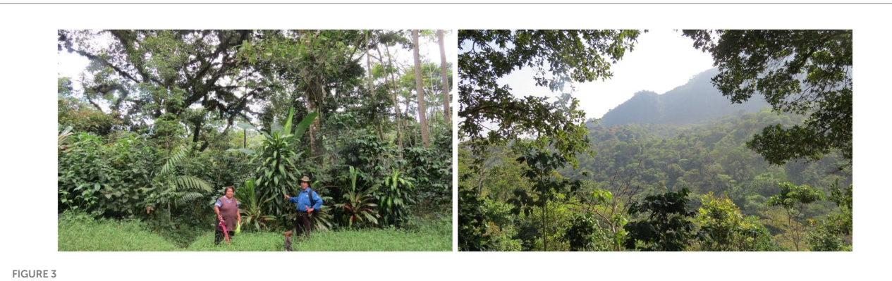
Edible coffee plantations in the communities of Gusmantla and Ixcatla, Ixhuatlán del Café, Veracruz, Mexico.

agroecology in 1999. Five years later they obtained organic production certification and began exporting high quality coffee.